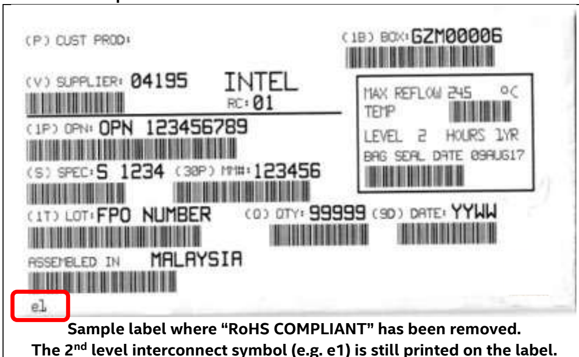
Sample label where “RoHS COMPLIANT” has been removed. The 2 nd level interconnect symbol (e.g. e1) is still printed on the label.